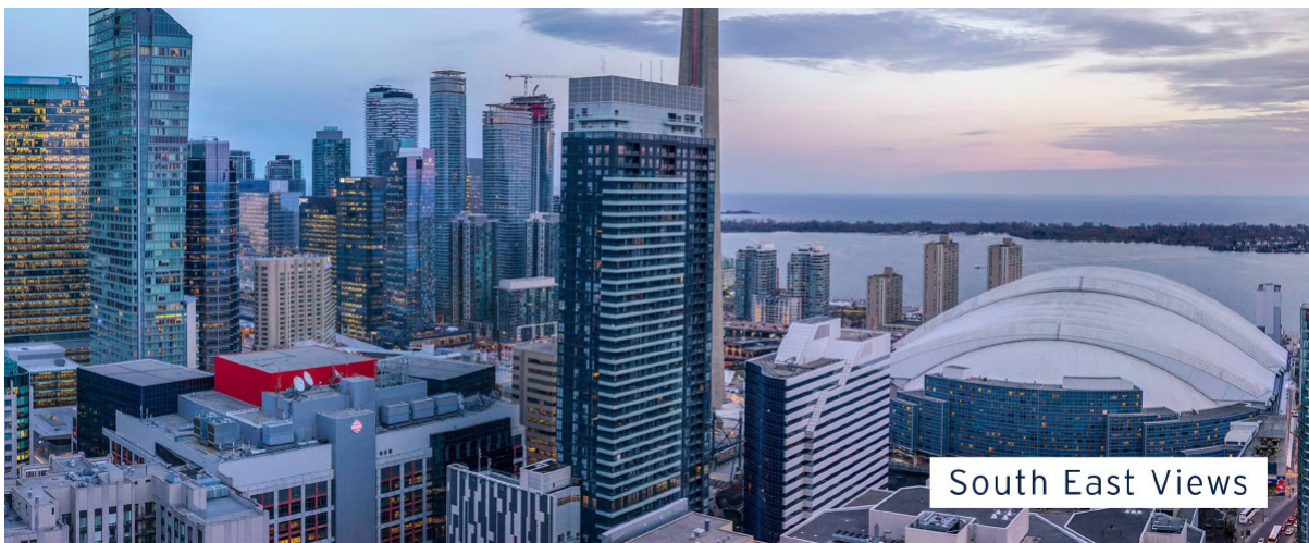
South East Views