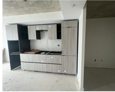
Suites at RUSH condos are starting to take shape with kitchens and tile installation happening on lower floors and suite boarding and framing being completed on higher floors.