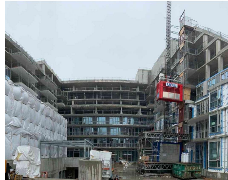
Concrete formwork at Wonder Condos is complete! Window installation, heritage brick re-pointing and suite framing are all ongoing.