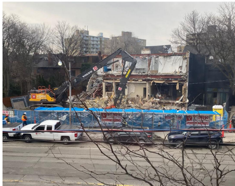
Demolition is underway at 321 Davenport. The next stages of construction include excavation, shoring and underground formwork.