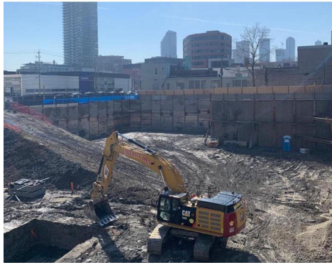
Excavation and shoring at 28 Eastern are now complete! The first of two crane bases is currently being poured.