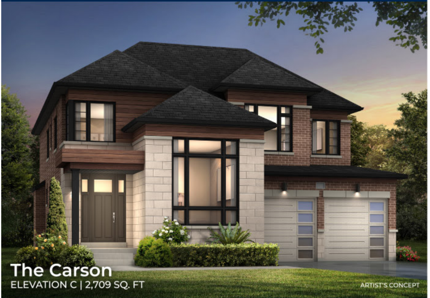
The Carson ELEVATION C | 2,709 SQ. FT