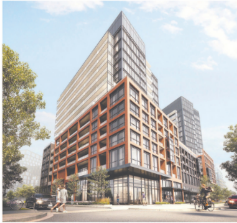
Express 2's 283 units, spread over a 15- and 16-story tower, are scheduled to be completed by late 2023.

According to Loutis, Malibu was one of the first developers to heed the City's call regarding housing intensification around Wilson Station. "We analyzed all the steps along the Yonge/University line, and found that only Wilson had no intensification around it."