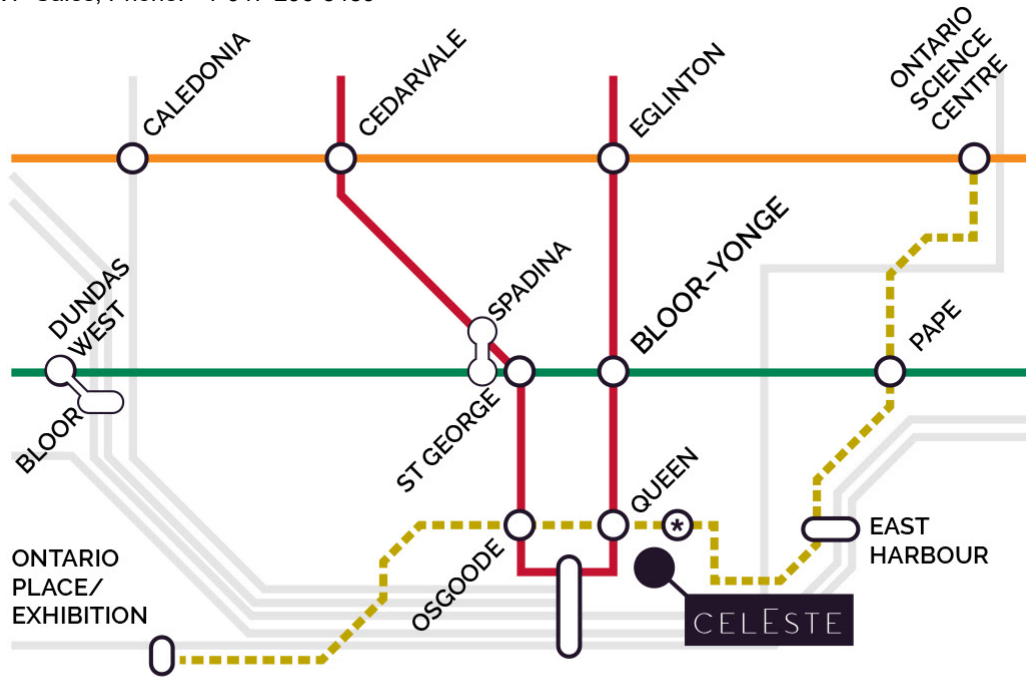
* Future Ontario Line subject to government approval.

Click the link below to download our investment package to learn even more